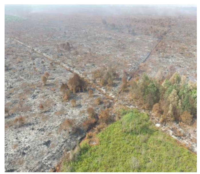
PHOTO: BURNED PEATLAND IN FORMER SMG AFFILIATE THAT HAD LICENSE REVOKED IN 2016.

An investigation in 2018 found that two SMG 'shadow companies' had deforested 8,000 ha of forest and peatland in West Kalimantan. SMG had taken deliberate measures to disguise its ownership of these companies, including using employees as nominee shareholders. SMG and its subsidiaries is a systemic corporate governance issue. A 2017 study also revealed that many of its major wood fiber suppliers – described as 'independent' pulpwood plantation companies – have extensive ownership links with SMG. The Forest Stewardship Council (FSC) stated that SMG's "pattern of using corporate proxies to control operations without legal ownership is very alarming", and later suspended their roadmap to re-associate SMG's pulp and paper division (APP) with the certification body, illustrating the market risks of SMG's corporate secrecy.